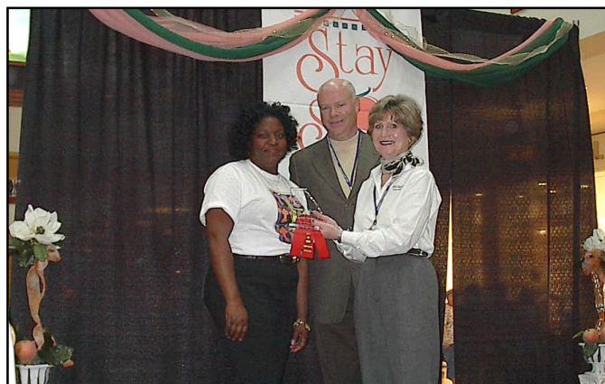
CowParade Atlanta won the Best of Show Corporate Sponsor Award at the Stay & See Georgia Travel Show sponsored by the GDITT. Congratulations!